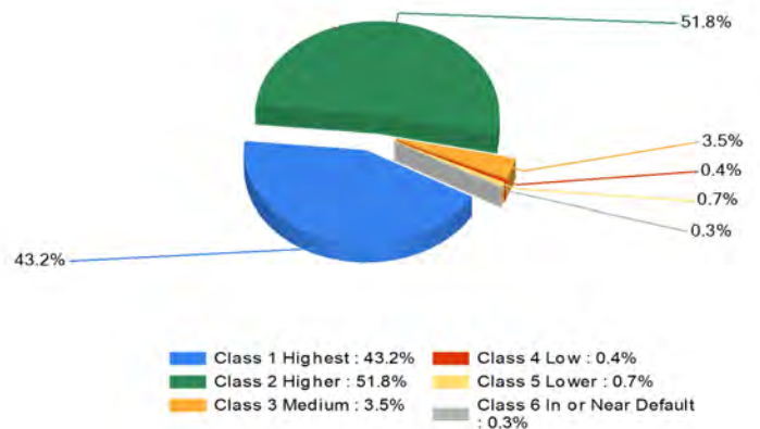
Distribution of bond classes

A Best's Financial Strength Rating opinion addresses the relative ability of an insurer to meet its ongoing insurance obligations. It is not a warranty of a company's financial strength and ability to meet its obligations to policyholders. View our Important Notice: Best's Credit Ratings for a disclaimer notice and complete details at http://www.ambest.com/ratings/notice .