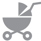
THE BIRTH OF A CHILD