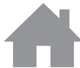
BUYING A HOME