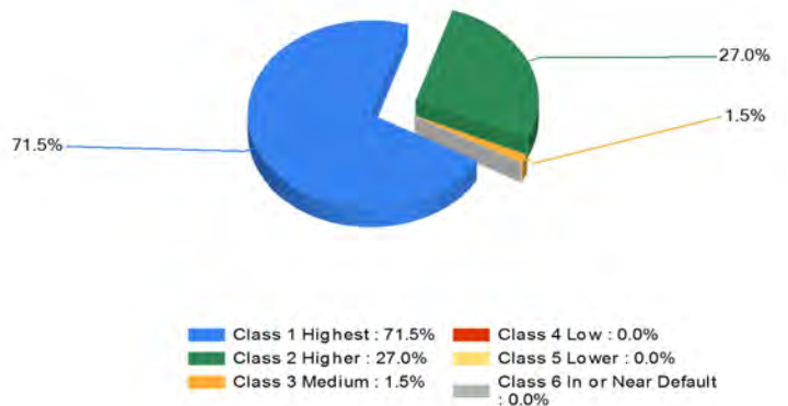
Distribution of bond classes

A Best's Financial Strength Rating opinion addresses the relative ability of an insurer to meet its ongoing insurance obligations. It is not a warranty of a company's financial strength and ability to meet its obligations to policyholders. View our Important Notice: Best's Credit Ratings for a disclaimer notice and complete details at http://www.ambest.com/ratings/notice .