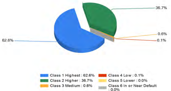
Distribution of bond classes

A Best's Financial Strength Rating opinion addresses the relative ability of an insurer to meet its ongoing insurance obligations. It is not a warranty of a company's financial strength and ability to meet its obligations to policyholders. View our Important Notice: Best's Credit Ratings for a disclaimer notice and complete details at http://www.ambest.com/ratings/notice .