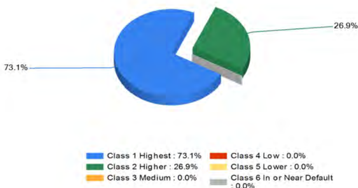
Distribution of bond classes

A Best's Financial Strength Rating opinion addresses the relative ability of an insurer to meet its ongoing insurance obligations. It is not a warranty of a company's financial strength and ability to meet its obligations to policyholders. View our Important Notice: Best's Credit Ratings for a disclaimer notice and complete details at http://www.ambest.com/ratings/notice .