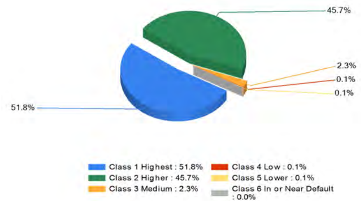
Distribution of bond classes