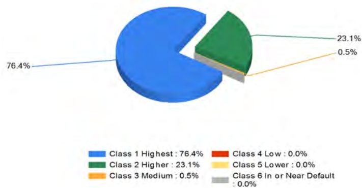
Distribution of bond classes