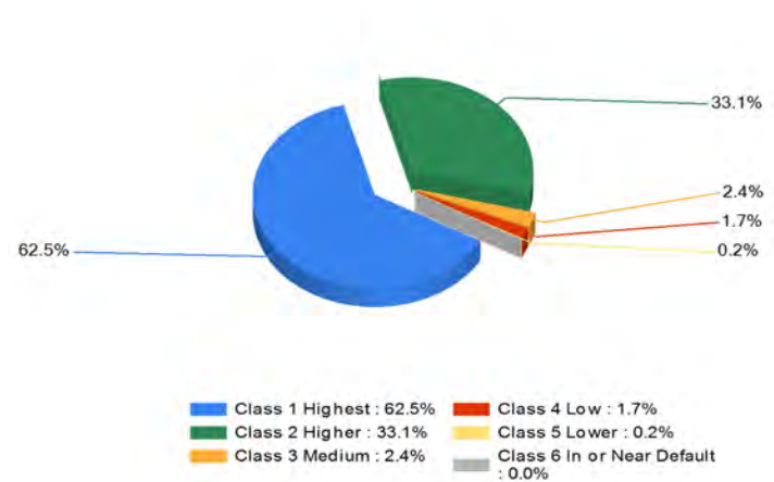
Distribution of bond classes