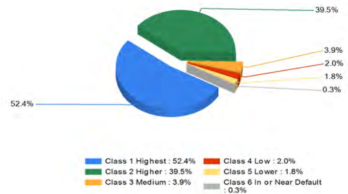
Distribution of bond classes