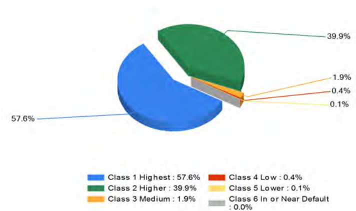
Distribution of bond classes