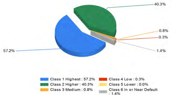
Distribution of bond classes

A Best's Financial Strength Rating opinion addresses the relative ability of an insurer to meet its ongoing insurance obligations. It is not a warranty of a company's financial strength and ability to meet its obligations to policyholders. View our Important Notice: Best's Credit Ratings for a disclaimer notice and complete details at http://www.ambest.com/ratings/notice .