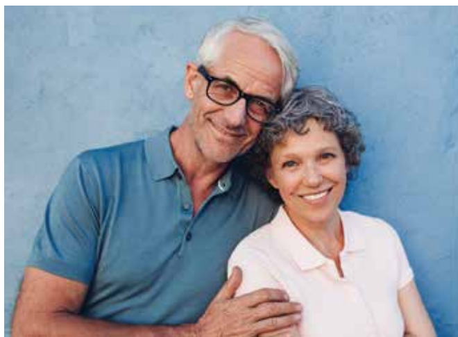
Joint Life Male, age 67 | Female,age 67

Joint to Spouse: 100% payment guaranteed until both deaths